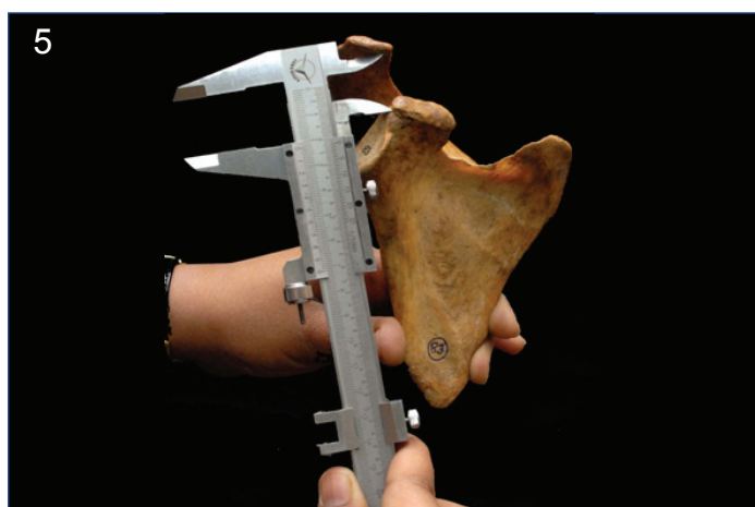
[Table/Fig-5]: Distance between supraglenoid tubercle to acromion process.

as coraco acromial length and acromio glenoid distance (Ac – g dis) as shown in [Table/Fig-1-5].